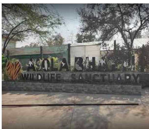
ASOLA BHATTI WILD LIFE SANCTUARY