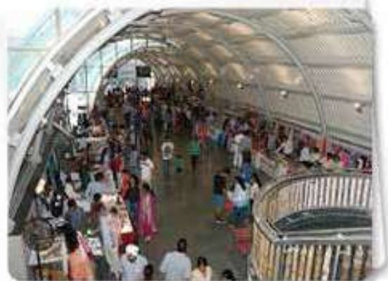
DILLI HAAT JANAKPURI