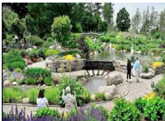
GARDEN OF FIVE SENSES