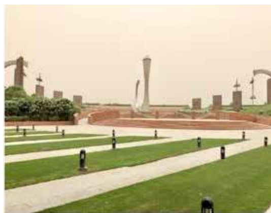
GURU TEG BAHADUR MEMORIAL AT NH-1