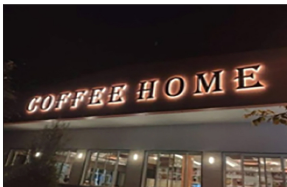
COFFEE HOME CONNAUGHT PLACE