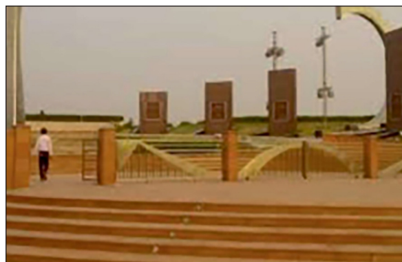
GURU TEG BAHADUR MEMORIAL