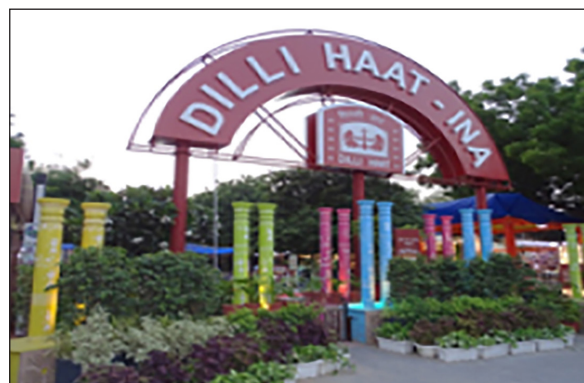
DILLI HAAT INA