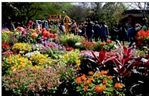
GARDEN OF FIVE SENSES