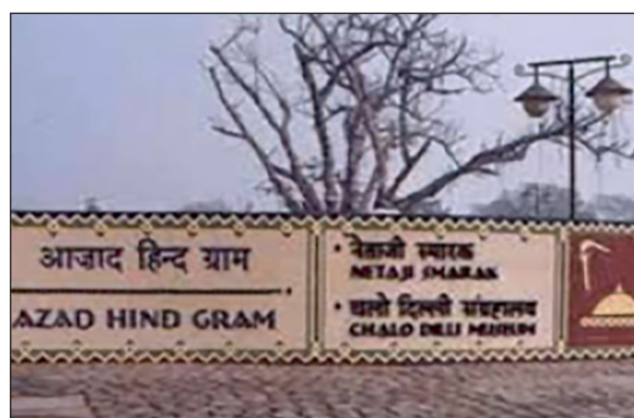
AZAD HIND GRAM

Delhi is known for its rich heritage and culture. To promote experiential tourism, various Haunted and Heritage walks are being organised by DTTDC, which are as follows:-