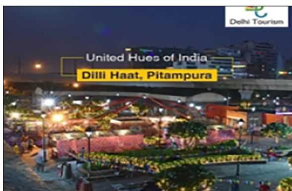
DILI HAAT PITAMPURA